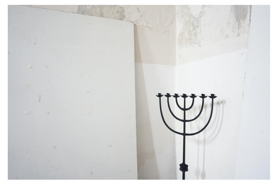
We first tasted this recipe on a trip to Jerusalem. The flavors and smell of it bring back the warmth and beauty of of Israel.