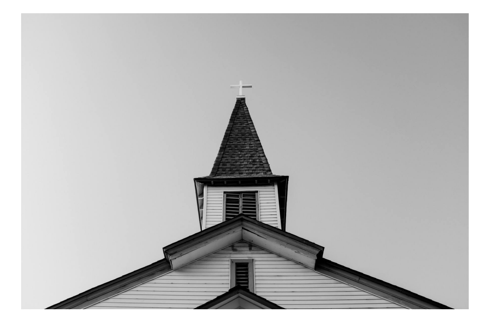
This book is dedicated to our tireless church community.

"The Lord bless you and keep you; the Lord make his face shine on you and be gracious to you; the Lord turn his face toward you and give you peace."